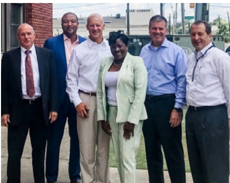
2019 BOARD AT DREAMLAND