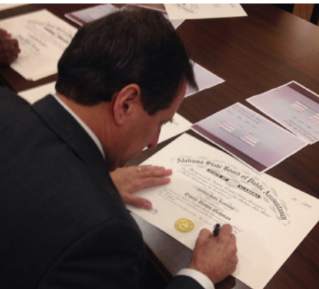
BLACKMON SIGNING CERTIFICATES